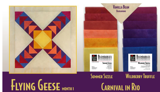
Carnival in Rio