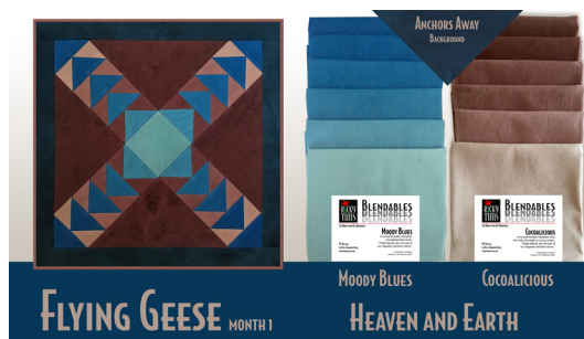
Heaven and Earth