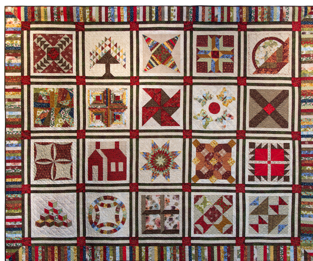
LEGACY QUILT (2015), BLOCKS ARE 15" FINISHED.

I chose fabrics for the theatrical quilt to represent fabrics similar to fabrics that were from the pioneer days. The quilt shown here is the actual quilt from the show. It is presented horizontally because the stage was not large enough for it to be presented vertically.