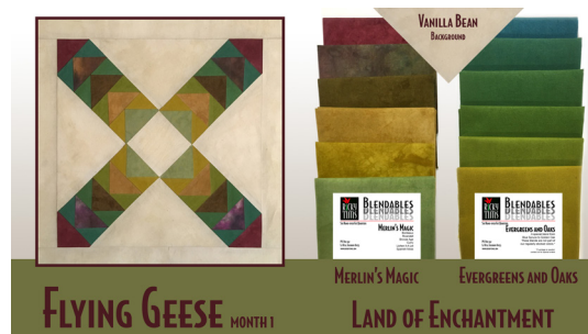
Land of Enchantment